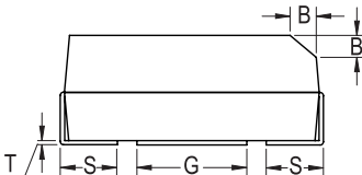
ANODE (+) END VIEW